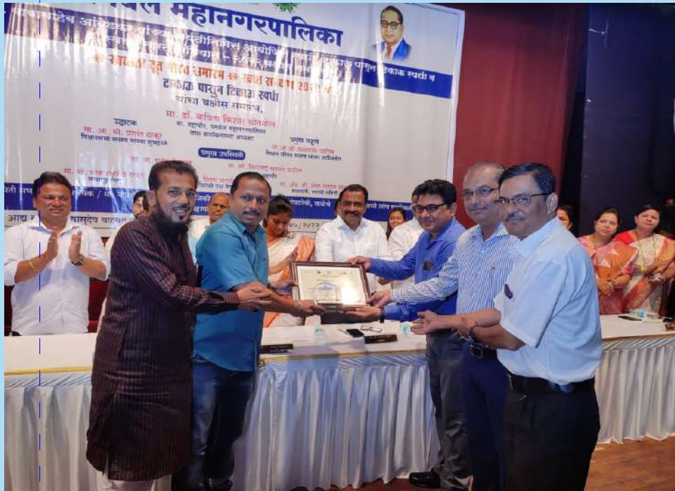
Swachhata Sarvekshan 2021, by Panvel Municipal Corporation