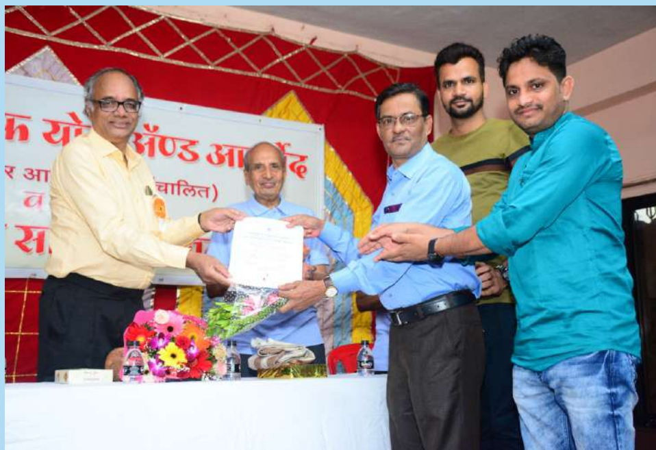
Appriciation for the participation in 1 lakh Surya Namaskar Campaign by Arogya Seva Samiti Panvel