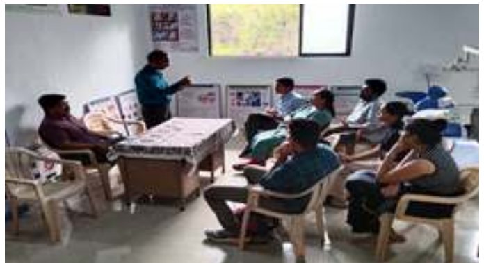
Summer Internship Training

As part of their learning goals, the students were actively involved in field projects and community-based assignments, expanding their knowledge beyond the confines of the classroom. Upon the conclusion of the two-week program, the students organized a Health Education program, featuring engaging activities such as role-playing and exhibitions focused on diabetes, held at the Nimkar Health Post. Simultaneously, students specializing in Nutrition and Health executed a project involving the assessment of nutritional status among preschool children through anthropometry in Anganwadi's.