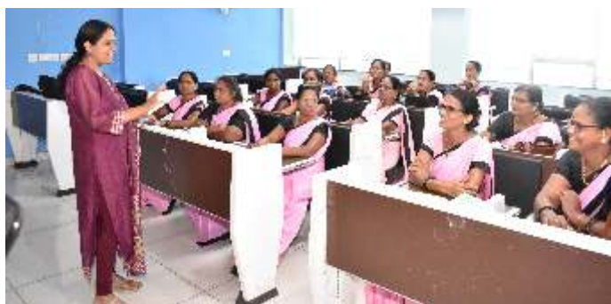
Health checkup of Anganwadi worker during the NCD screening camp.

breast examination, which can be performed at home on a regular basis to detect breast cancer. Pre- and post-counselling assessments are also done.