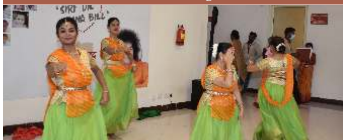
Kathak Dance performances on theme of importance breastfeeding .

The DHPE students of NIPHTR presented a Bharud, a popular folk art of Maharashtra, set in a village setup. The performance skilfully addressed prevalent myths in society regarding breastfeeding practices. The event's finale featured a mesmerizing dance drama by the Kathak group. This musical performance depicted the transformative journey of a woman, from being a young bride to becoming a mother, emphasizing the manifold benefits of breastfeeding for both the mother and the child. The event garnered a positive response from the target audience, comprising pregnant and lactating mothers, as well as parents present in the cardiac OPD. As part of the health promotion activity, a poster exhibition was also arranged, adding to the comprehensive and impactful nature of the celebration.