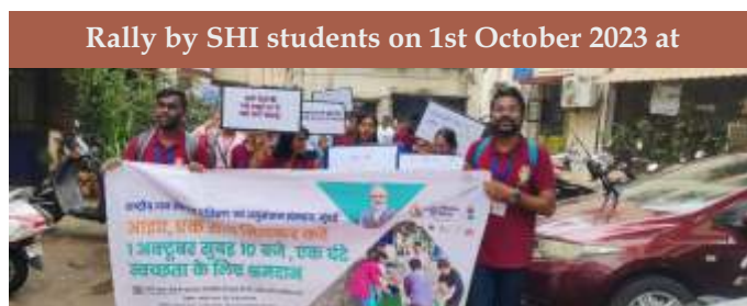
Rally by SHI students on 1st October 2023 at

The participants were divided into different small groups, and each group initiated a cleaning campaign in Arya Nagar society, roads, and the school premises, covering the area around the Arya Nagar Society and Tulsiwadi Path. The output of the event was significant, with more than 10 bags of waste materials and garbage collected from all places, including the school playground. The collected materials were safely disposed of with the assistance of a city corporation waste vehicle carrying van. Additionally, nearly 2 km of the main road, along with gullies, was effectively cleaned during the event.