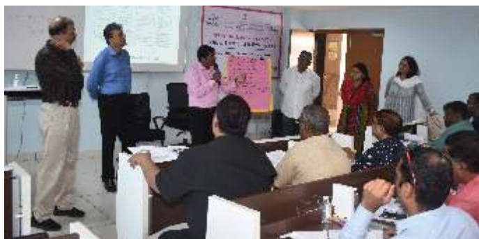
Participants of Senior Master Training presenting group work