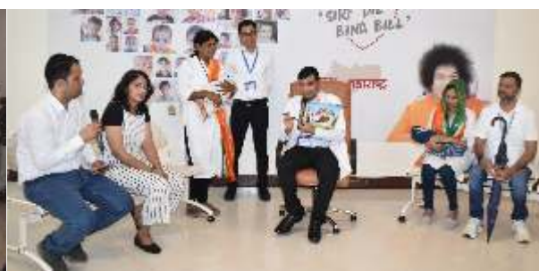
Street play presentation by DHPE and PGDCHC trainees on Importance of breast feedingmg .