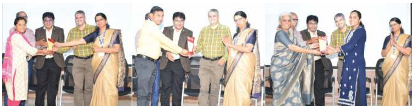
Guest presenting awards to winners of Essey