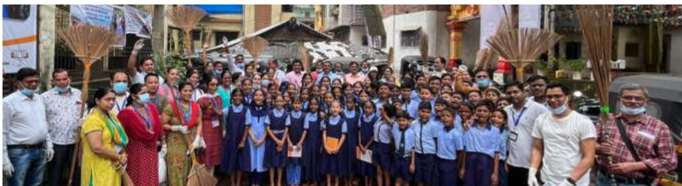
participants of Swachhata hi Seva Abhiyan