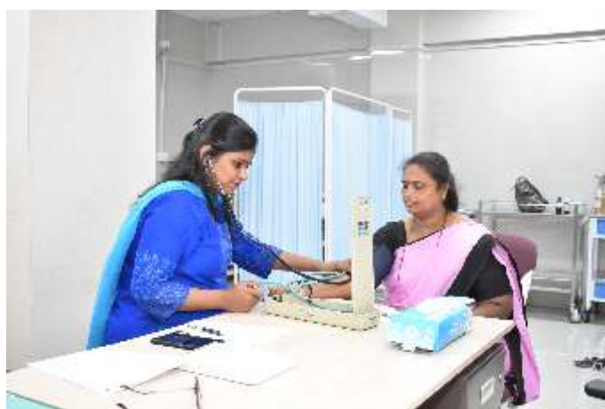
Blood pressure checkup of Anganwadi worker during the NCD screening camp.

Anganwadi workers were screened in batches of 30. Initially, counselling sessions were conducted regarding noncommunicable diseases like diabetes, hypertension, oral, cervical, and breast cancer, with explanations of symptoms and signs and how to detect these NCDs at an early stage for a better treatment outcome. It also includes a demonstration and video presentation about self-