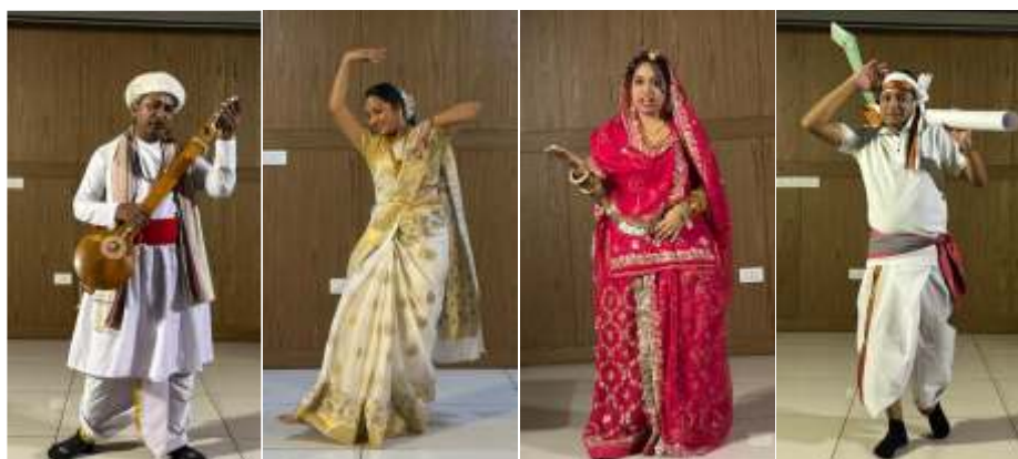
Traditional Dress Presentation by DHPE and PGDCHC Trainees