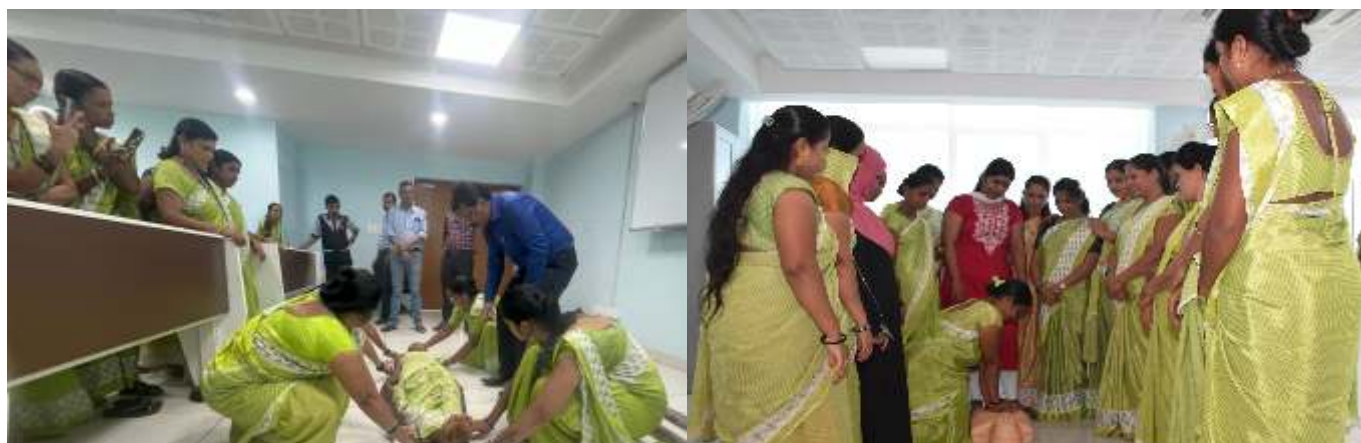
ASHA Workers redemonstrating the skills learned during the first responder training program.