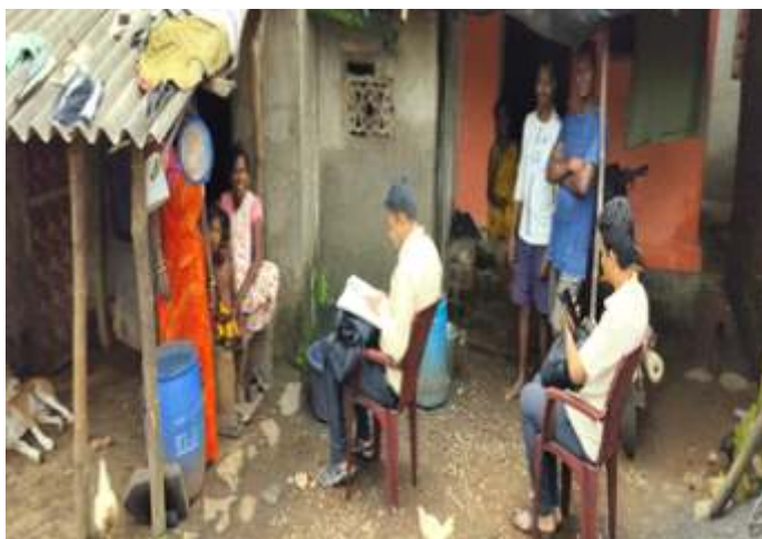
Data Collection by the field workers in Mumbai slums

NIPHTR, Mumbai, functions as one of the ten peripheral centers for the ICMR's National Taskforce project titled "Multi Centric Community-Based Study of Prevalence, KAP (Knowledge, Attitude & Practice) for Prevention & First Aid of Burns, Quality of Life, and Out-of-Pocket Expenditure of Burns Injury, and Evaluation of IEC (Information, Education, Communication) Interventions."