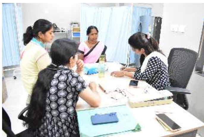
Health checkup of Anganwadi worker during the NCD screening camp.

to SDH, and those with gynecological problems contacted NIPHTR for a gynecological consultation on the first Monday of each month. A total of 253 AWWs were screened until August 31, 2023, and a pap smear examination was conducted for 46.