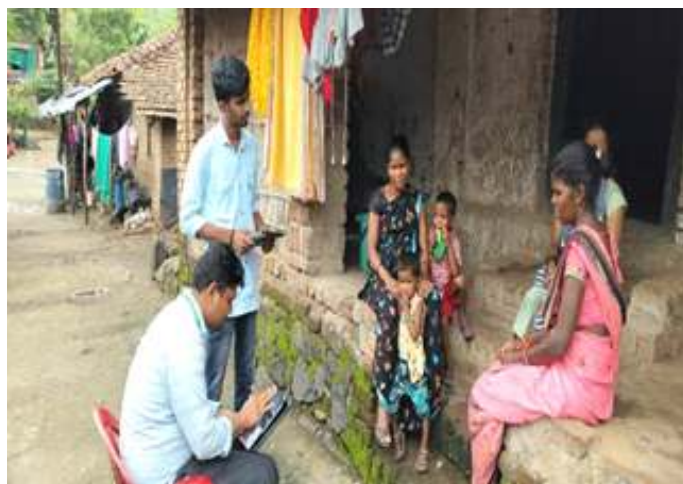
Data Collection by the field workers in Village