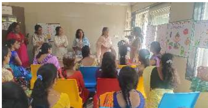
Role presentation by PGDCHC trainees on Importance of Nutrition .

NIPHTR enthusiastically celebrated the National Nutrition Week program for the year 2023, focusing on the theme "Healthy diet going affordable for all." On September 1, 2023, a comprehensive health exhibition and talk on nutrition were meticulously organized at R S Nimkar UPHC in Tardeo, Mumbai. The event aimed to promote awareness about nutritious food choices that are accessible to everyone.