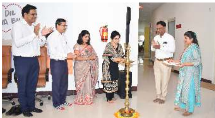
Inauguration of the Breastfeeding week at Sathya Sai Sanjeevani Hospital by Lamp lighting

World Breastfeeding Week 2023 The National Institute of Public Health Training & Research (NIPHTR) Panvel, in collaboration with Sri Sathya Sai Sanjeevani Center Kharghar, joyously celebrated World Breastfeeding Week from August 1st to August 7th, 2023. The theme chosen for this year's celebration centered around Health Promotion through Traditional Communication Mediums, such as dance, street plays, Bharud, and more.