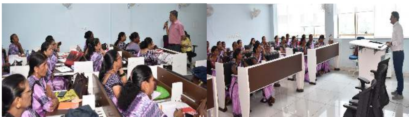
Session on Growth Monitoring by NIPHTR Faculties for the Anganwadi workers