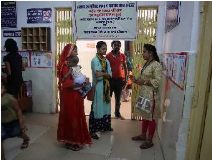
DHPE trainees explaining posters to patients at Civil Hospital Ranjhi, Jabalpur on WHO day