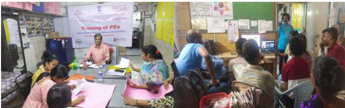
Training of the Peer Educator at the Field level in Chembur and Santacruz