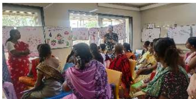
PGDCHC trainee explaining posters on Importance of Nutrition .