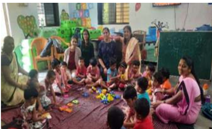
Summer Internship Trainees visited to Anganwadi

Additionally, students specializing in GIS in Health delved into mapping and data assessment, utilizing the information provided for their projects. The feedback from the students at the conclusion of the program was overwhelmingly positive. They regarded the SIP program as a productive and valuable experience that successfully aided them in achieving their learning goals.