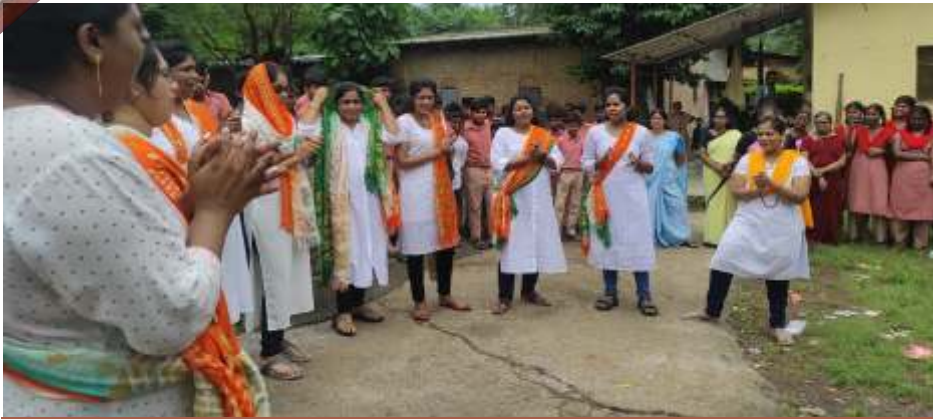
Street play presentation by DHPE and PGDCHC trainees on Importance of breast feedingmg .