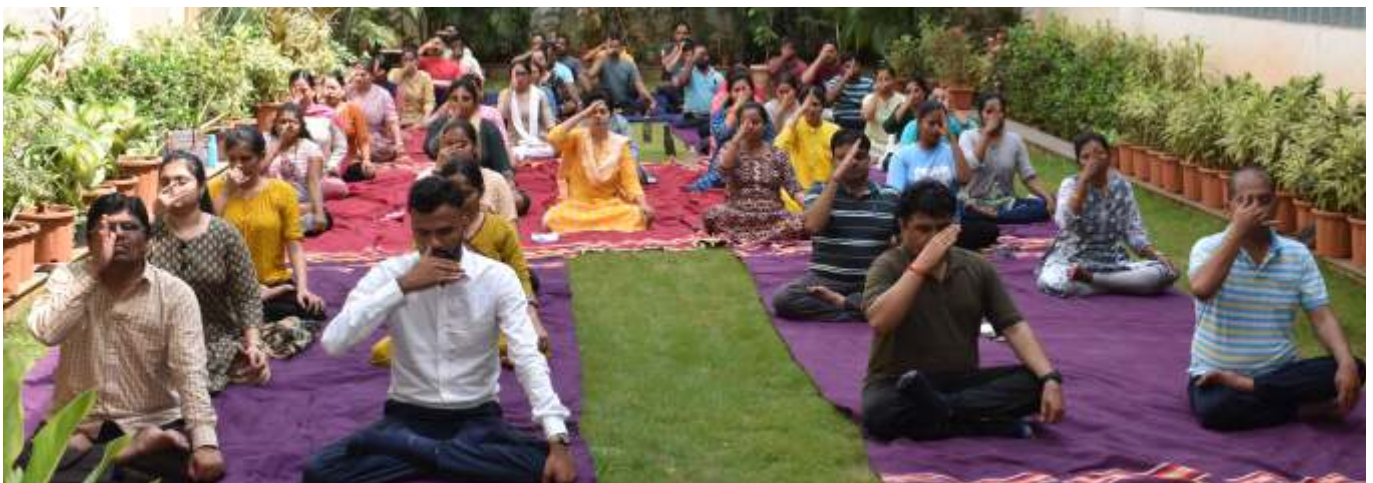
The Faculties, Staff and Trainees performing Yogasana

Yoga Club for the trainees of the year 2023-24. Trainees from the Education and Post Graduate Care participate in daily yoga